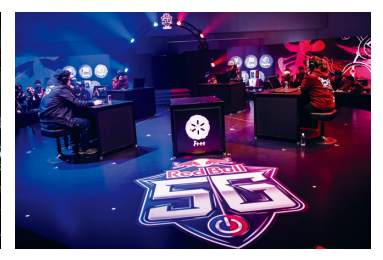
Red Bull 5G 2021