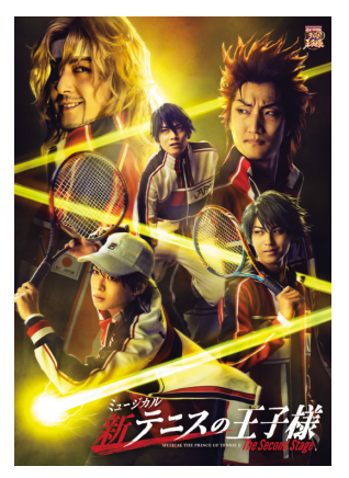
MUSICAL THE PRINCE OF TENNIS I The Second Stage

© 2009 TAKESHI KONOMI / 2022 MUSICAL THE PRINCE OF TENNIS II PROJECT