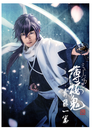
Musical HAKUOKI SHINKAI Side Saito Hajime