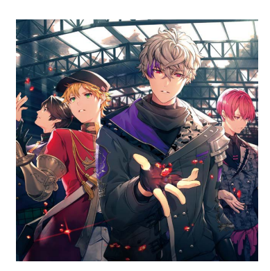
The Thousand Musketeers: Rhodoknight