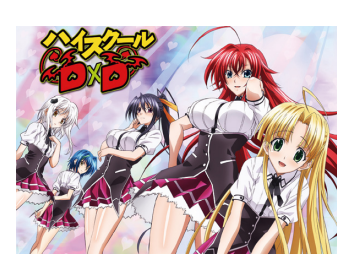
High School D×D