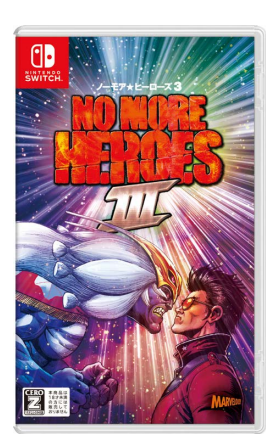
No More Heroes series No More Heroes 3 ©Marvelous Inc. / Grasshopper Manufacture Inc.