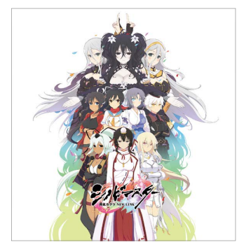
SHINOVI MASTER -SENRAN KAGURA NEW LINK-(Smartphone App)

©Marvelous Inc. ©HONEY PARADE GAMES Inc.