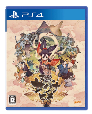
TENSUI NO SAKUNAHIME ©2020 Edelweiss. Licensed to and published by XSEED Games / Marvelous USA, Inc. and Marvelous, Inc.