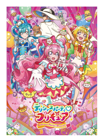
Delicious Party ♥ Pretty Cure ©Toei Animation. All Rights Reserved