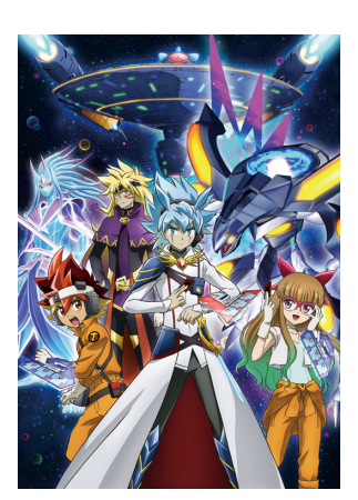
Yu-Gi-Oh! GO RUSH!! ©STUDIO DICE / SHUEISHA, TV TOKYO, KONAMI