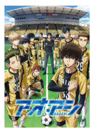
Aoashi