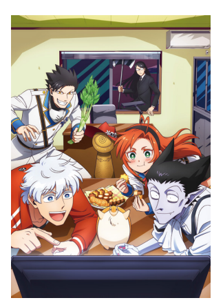
The Vampire dies in no time © Itaru Bonnoki (AKITASHOTEN)/ The Vampire dies in no time