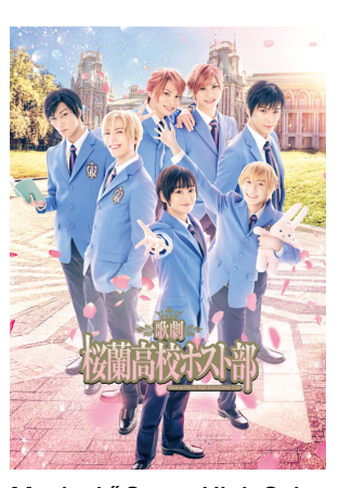
Musical "Ouran High School Host Club"