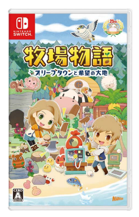
BOKUJO MONOGATARI series BOKUJO MONOGATARI OLIVE TOWN TO KIBO NO DAICHI