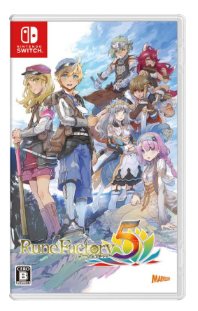
Rune Factory series Rune Factory 5 ©2021 Marvelous Inc.