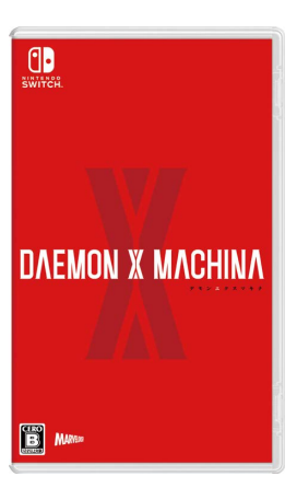
DAEMON X MACHINA ©2019 Marvelous Inc.