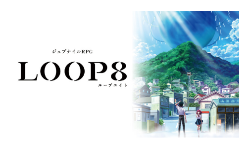
LOOP8 ©2022 Marvelous Inc.