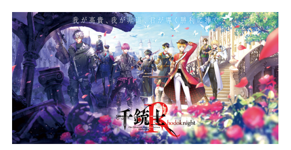
The Thousand Musketeers: Rhodoknight (Smartphone App)