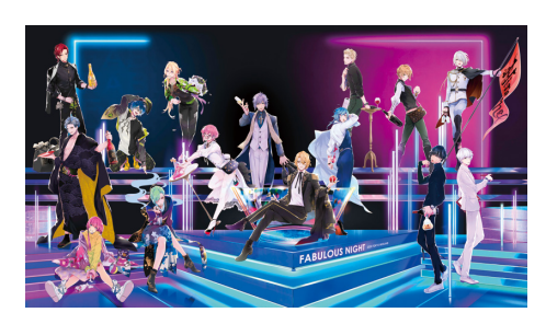
Fabulous Night ©Marvelous / Rejet

©WATARU WATARI,SHOGAKUKAN / OREGAIRU3 PRODUCTION COMMITTEE