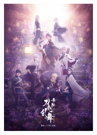
TOUKENRANBU THE STAGE Kiden Ikusayunoadabana

© 2009 TAKESHI KONOMI / 2022 MUSICAL THE PRINCE OF TENNIS II PROJECT