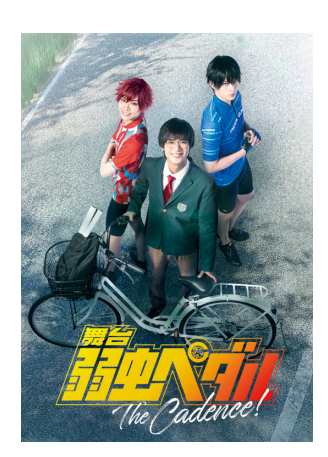
Stage[Yowamushi Pedal] The Cadence!

©IDEA FACTORY · DESIGN FACTORY / Musical HAKUOKI Project