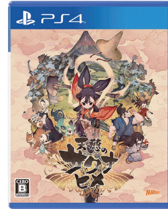
TENSUI NO SAKUNAHIME ©2020 Edelweiss. Licensed to and published by XSEED Games / Marvelous USA, Inc. and Marvelous, Inc.