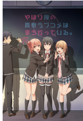
My Teen Romantic Comedy SNAFU Climax