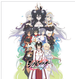
SHINOVI MASTER -SEN-RAN KAGURA NEW LINK- (F2P App)

©Marvelous Inc. ©HONEY PARADE GAMES Inc.