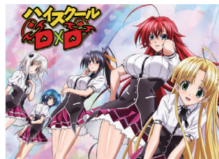
High School D x D (Mobile Browser)

©Ichi Ishibumi · Miyama-ZERO/KADOKAWA/HighSchoolIDD HERO PARTNERS ©Marvelous Inc.