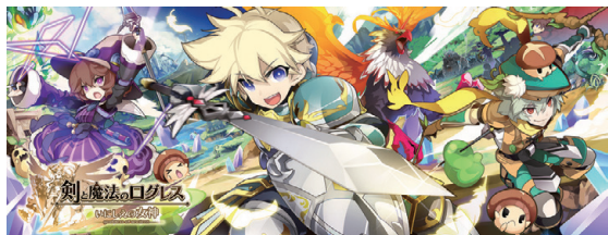
Logres of Swords and Sorcery: Goddess of Ancient (F2P App)