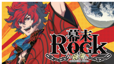
Samurai Jam -Bakumatsu Rock-: Ultimate Soul (Paid App)

©Ichi Ishibumi · Miyama-ZERO/KADOKAWA/HighSchoolIDD HERO PARTNERS ©Marvelous Inc.