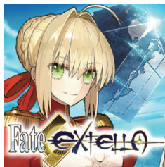
Fate/EXTELLA (Paid App)