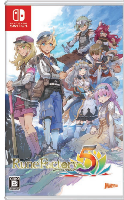
Rune Factory series Rune Factory 5 ©2021 Marvelous Inc.