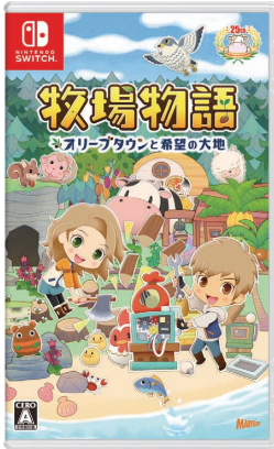
BOKUJO MONOGATARI series BOKUJO MONOGATARI OLIVE TOWN TO KIBO NO DAICHI