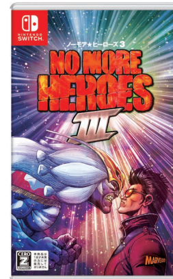
No More Heroes series No More Heroes 3 ©Marvelous Inc. / Grasshopper Manufacture Inc.