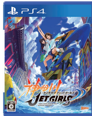
KANDAGAWA JET GIRLS ©2020 Marvelous Inc./HONEY PARADE GAMES Inc. ©2019 KJG PARTNERS