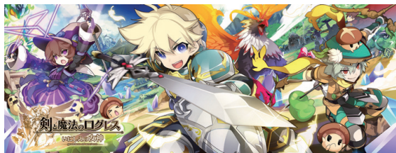
Logres of Swords and Sorcery: Goddess of Ancient (F2P App)