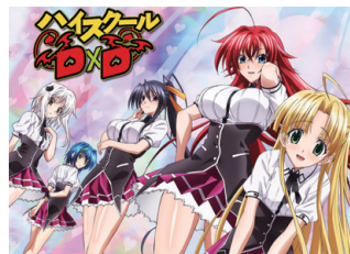
High School D x D (Mobile Browser)

©Ichiei Ishibumi · Miyama-ZERO/KADOKAWA/HighSchoolIDD HERO PARTNERS ©Marvelous Inc.