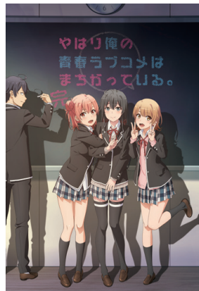
My Teen Romantic Comedy SNAFU Climax