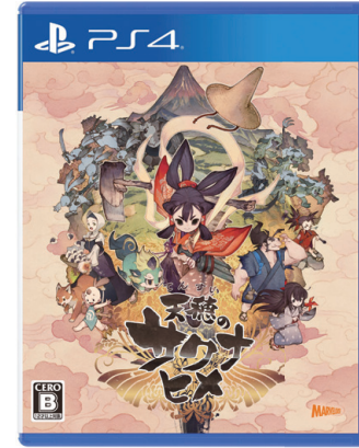
TENSHI NO SAKUNAHIME ©2020 Edelweiss. Licensed to and published by XSEED Games / Marvelous USA, Inc. and Marvelous, Inc.