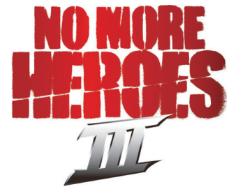
No More Heroes series No More Heroes 3 ©Marvelous Inc. / Grasshopper Manufacture Inc.