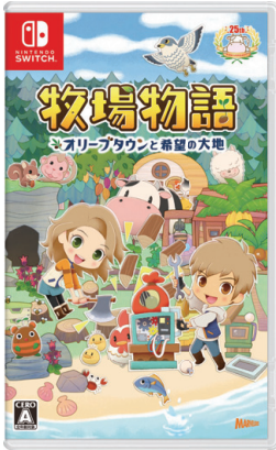
BOKUJO MONOGATARI series BOKUJO MONOGATARI OLIVE TOWN TO KIBO NO DAICHI