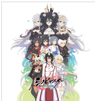
SHINOVI MASTER -SENRAI KAGURA NEW LINK- (F2P App)

©Marvelous Inc. ©HONEY PARADE GAMES Inc.