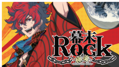
Samurai Jam -Bakumatsu Rock-: Ultimate Soul (Paid App)

©Ichiei Ishibumi · Miyama-ZERO/KADOKAWA/HighSchoolIDD HERO PARTNERS ©Marvelous Inc.