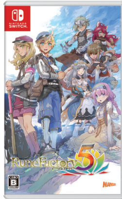
Rune Factory series Rune Factory 5 ©2021 Marvelous Inc.