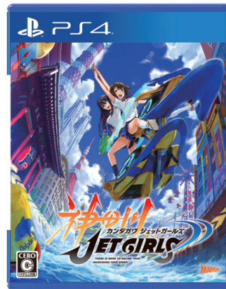
KANDAGAWA JET GIRLS ©2020 Marvelous Inc./HONEY PARADE GAMES Inc. ©2019 KJG PARTNERS