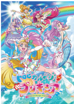
Tropical-Rouge ! Pretty Cure