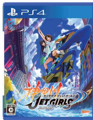
KANDAGAWA JET GIRLS ©2020 Marvelous Inc./HONEY PARADE GAMES Inc. ©2019 KJG PARTNERS