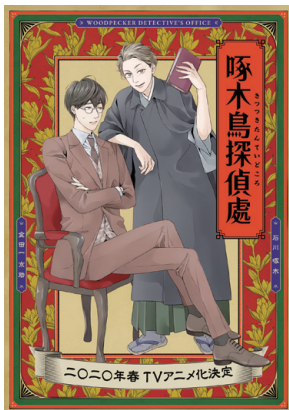
Woodpecker Detective's Office