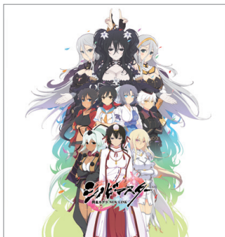
SHINOVI MASTER -SENRAI KAGURA NEW LINK- (F2P App)

©Marvelous Inc. ©HONEY PARADE GAMES Inc.