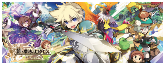
Logres of Swords and Sorcery: Goddess of Ancient (F2P App)