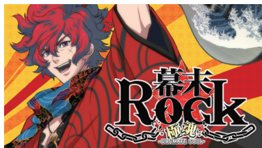
Samurai Jam -Bakumatsu Rock-: Ultimate Soul (Paid App)

©Ichiei Ishibumi・Miyama-ZERO/KADOKAWA/HighSchoolDD HERO PARTNERS ©Marvelous Inc.