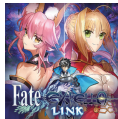
Fate/EXTELLA LINK (Paid App)