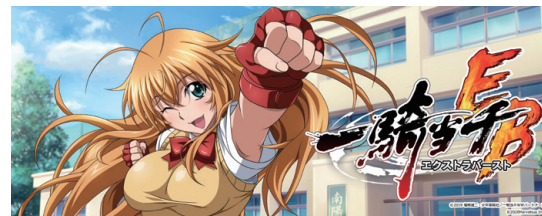
Ikki-Tousen Extra Burst (F2P App)

©Marvelous Inc. ©HONEY PARADE GAMES Inc.