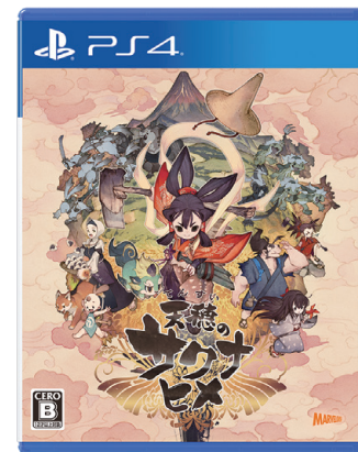
TENSUI NO SAKUNAHIME ©2020 Edelweiss. Licensed to and published by XSEED Games / Marvelous USA, Inc. and Marvelous, Inc.