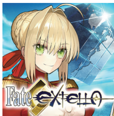
Fate/EXTELLA (Paid App)