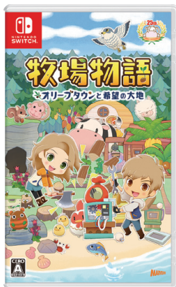
BOKUJO MONOGATARI series BOKUJO MONOGATARI OLIVE TOWN TO KIBO NO DAICHI ©2021 Marvelous Inc.