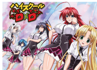
High School D x D (Mobile Browser)