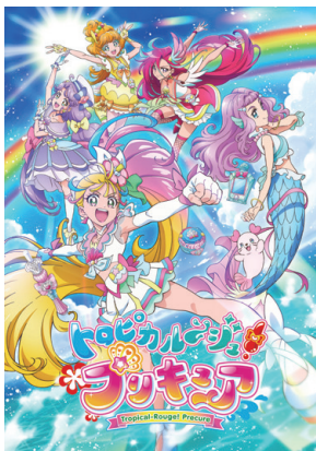
Tropical-Rouge ! Pretty Cure