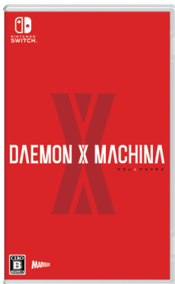
DAEMON X MACHINA ©2019 Marvelous Inc.