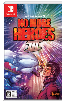
No More Heroes series No More Heroes 3 ©Marvelous Inc. / Grasshopper Manufacture Inc.