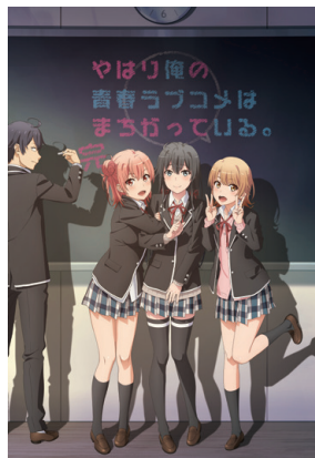
My Teen Romantic Comedy SNAFU Climax

©WATARU WATARI, SHOGAKUKAN / OREGAIRUS PRODUCTION COMMITTEE