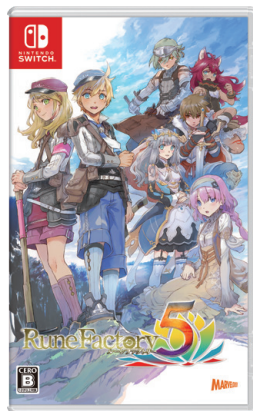
Rune Factory series Rune Factory 5 ©2021 Marvelous Inc.