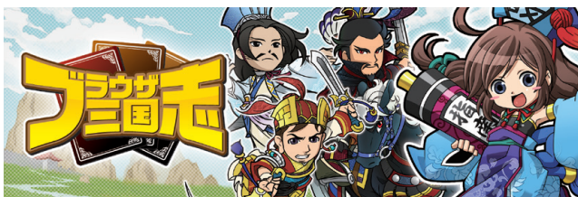
Browser Sangokushi (PC Browser)

©2019 YUJI SHIOZAKI・SHONENGAHOSHA/IKKITOUSEN WW PARTNERS ©2020 Marvelous Inc.