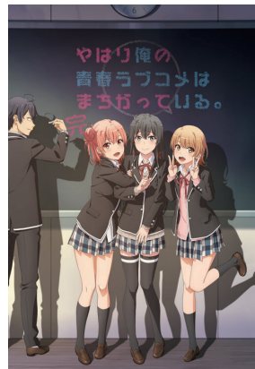
My Teen Romantic Comedy SNAFU Climax