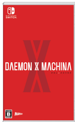
DAEMON X MACHINA ©2019 Marvelous Inc.