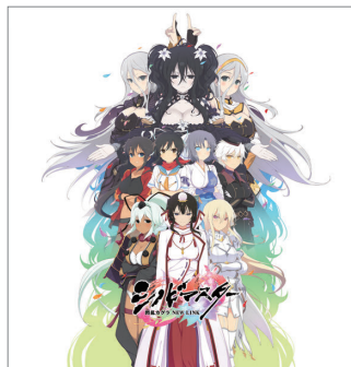
SHINOVI MASTER -SENTRAN KAGURA NEW LINK- (F2P App)