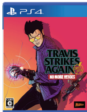
No More Heroes series Travis Strikes Again: No More Heroes Complete Edition ©Marvelous Inc. / Grasshopper Manufacture Inc.