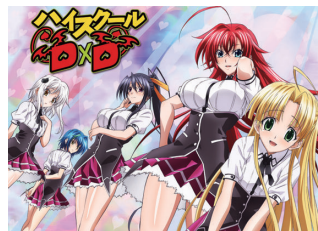
High School D × D (Mobile Browser)

©Ichiei Ishibumi・Miyama-ZERO/KADOKAWA/HighSchoolDD HERO PARTNERS ©Marvelous Inc.