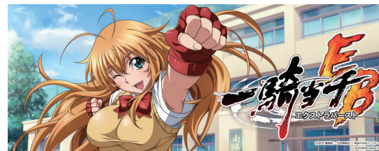
Ikki-Tousen Extra Burst (F2P App)

©Marvelous Inc. ©HONEY PARADE GAMES Inc.