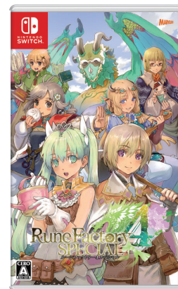
Rune Factory series Rune Factory 4 Special ©2019 Marvelous Inc.