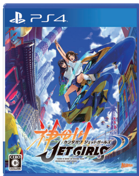
KANDAGAWA JET GIRLS ©2020 Marvelous Inc./HONEY PARADE GAMES Inc. ©2019 KJG PARTNERS