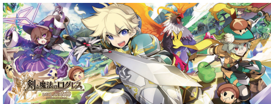
Logres of Swords and Sorcery: Goddess of Ancient (F2P App)