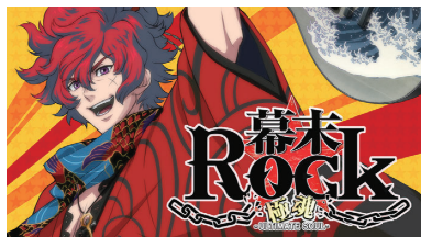
Samurai Jam -Bakumatsu Rock-: Ultimate Soul (Paid App)

©Ichiei Ishibumi・Miyama-ZERO/KADOKAWA/HighSchoolDD HERO PARTNERS ©Marvelous Inc.