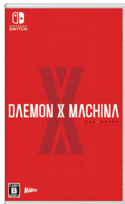
DAEMON X MACHINA ©2019 Marvelous Inc.