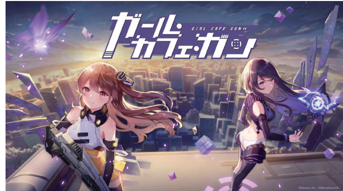
GIRL CAFE GUN

©Marvelous Inc. ©HONEY PARADE GAMES Inc.