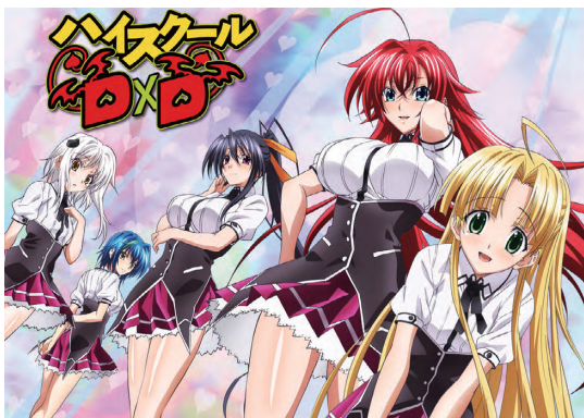
High School D×D