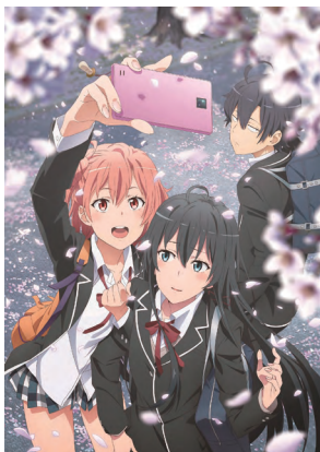
My Teen Romantic Comedy SNAFU Climax