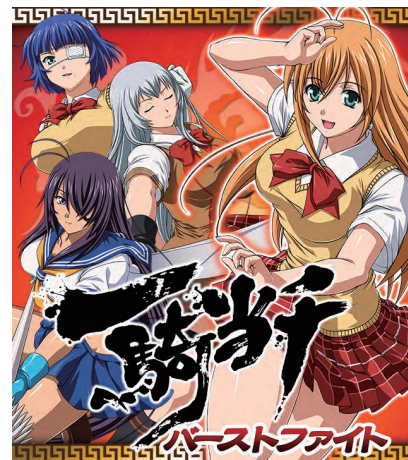
Ikki-Tousen Burst Fight