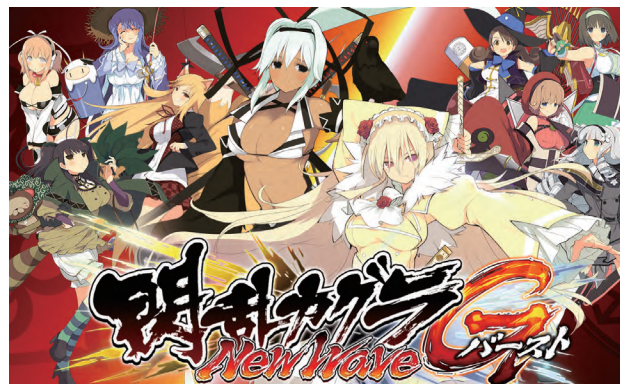
SENTRAN KAGURA NewWave G-Burst