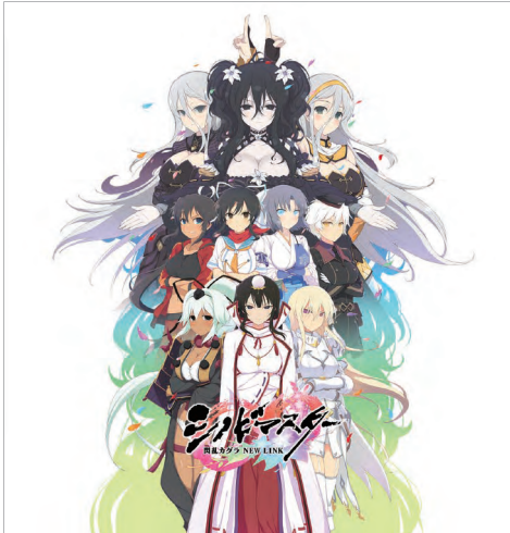
SHINOVI MASTER -SEN-RAN KAGURA NEW LINK-

©Marvelous Inc. ©HONEY PARADE GAMES Inc.