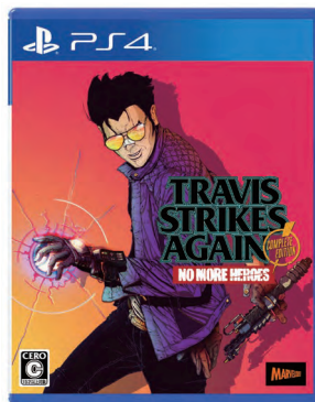
No More Heroes series Travis Strikes Again: No More Heroes Complete Edition ©Marvelous Inc. / Grasshopper Manufacture Inc.