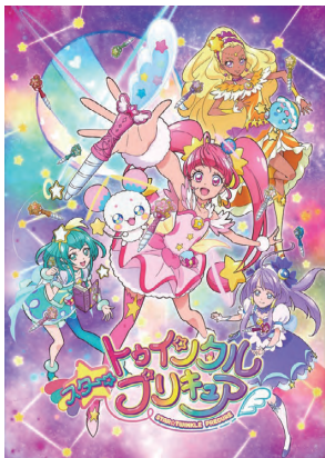
Star☆Twinkle Pretty Cure