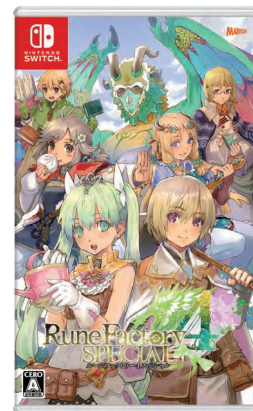
Rune Factory series Rune Factory 4 Special