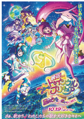
Star☆Twinkle Pretty Cure the Movie