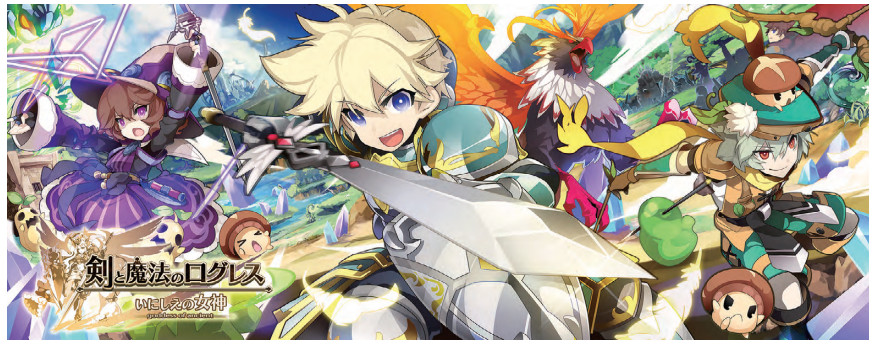
Logres of Swords and Sorcery: Goddess of Ancient