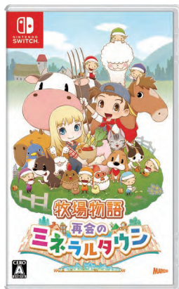
BOKUJO MONOGATARI series BOKUJO MONOGATARI SAIKAI NO MINERAL TOWN ©2019 Marvelous Inc.