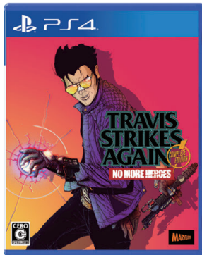
No More Heroes series Travis Strikes Again: No More Heroes Complete Edition ©Marvelous Inc. / Grasshopper Manufacture Inc.