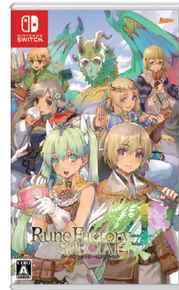
Rune Factory series Rune Factory 4 Special ©2019 Marvelous Inc.