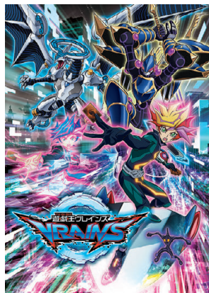
Yu-Gi-Oh! VRAINS ©1996 Kazuki Takahashi ©2017 NAS・TV TOKYO