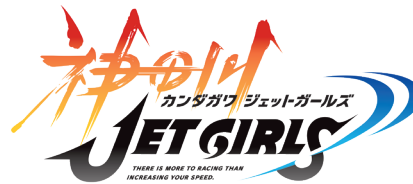
KANDAGAWA JET GIRLS ©2019 Marvelous Inc./HONEY PARADE GAMES Inc. ©2019 KJG PARTNERS