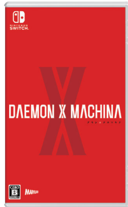
DAEMON X MACHINA ©2019 Marvelous Inc.