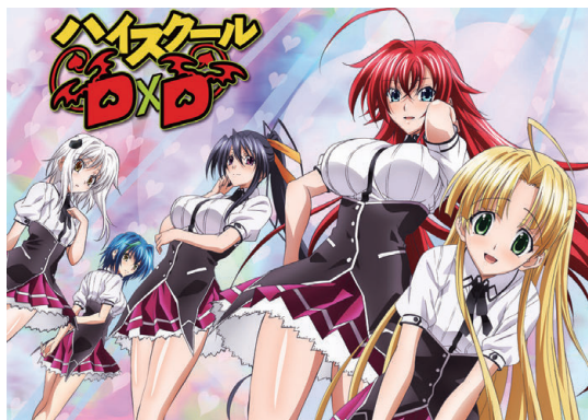
High School D×D