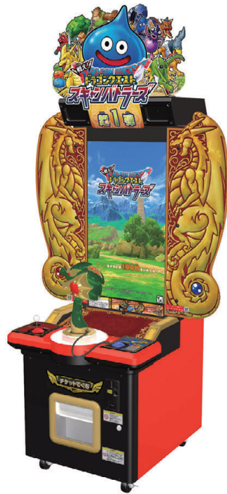
DRAGON QUEST SCANBATTLERS

©2019 Pokémon. ©1995-2019 Nintendo/Creatures Inc. / GAME FREAK inc. Developed by T-ARTS and MARV TM, (R), and character names are trademarks of Nintendo.