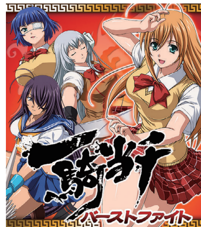
Ikki-Tousen Burst Fight