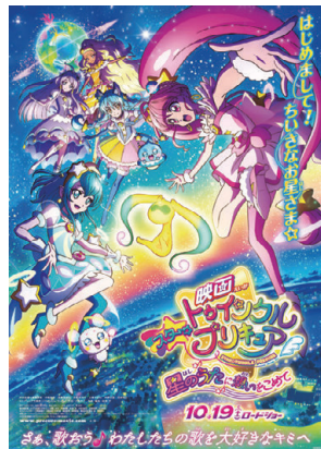
Star Twinkle Pretty Cure the Movie ©2019 Star Twinkle Pretty Cure the Movie Production Committee