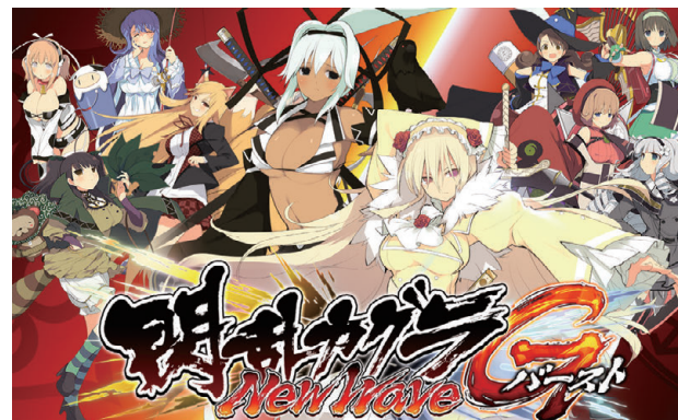
SENTRAN KAGURA NewWave G-Burst