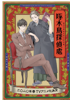
Woodpecker Detective's Office ©2020 Kei Ii, Tokyo Sogensha Co., Ltd./ "Woodpecker Detective's Office" Project