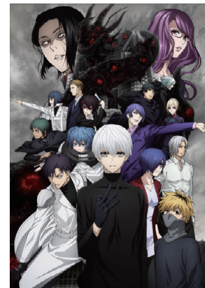
Tokyo Ghoul:re ©Sui Ishida/Shueisha, Tokyo Ghoul:re Production Committee