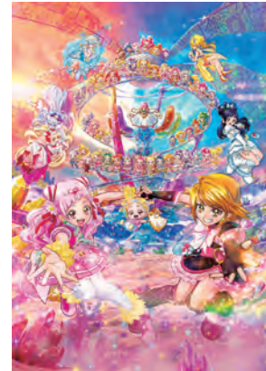
Hug! Pretty Cure, Futari wa Pretty Cure the Movie