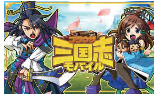
Browser Sangokushi for Mobile