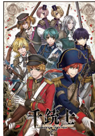
The Thousand Noble Musketeers