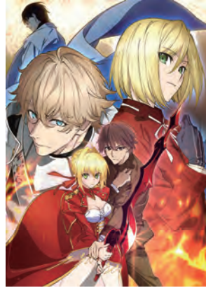
Fate/EXTRA Last Encore

©TYPE-MOON/Marvelous, Aniplex, Notes, SHAFT