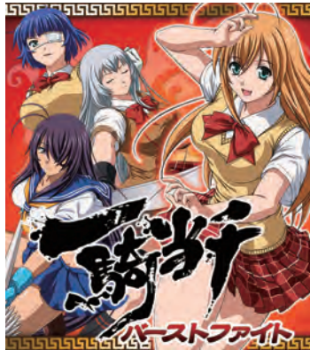
Ikki-Tousen Burst Fight