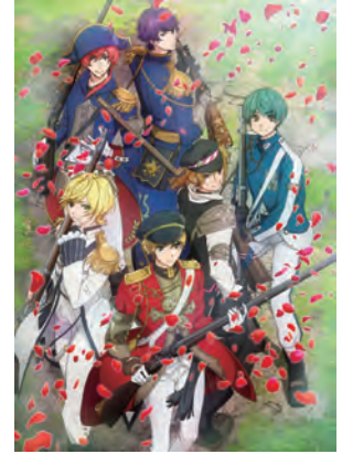
The Thousand Masketeers

©Sui Ishida/Shueisha, Tokyo Ghoul:re Production Committee