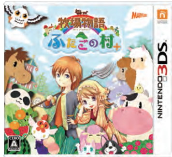
BOKUJO MONOGATARI series BOKUJO MONOGATARI FUTAGO NO MURA + ©2017 Marvelous Inc. All Rights Reserved.