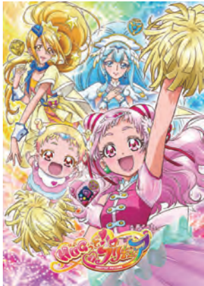
HUG! Pretty Cure