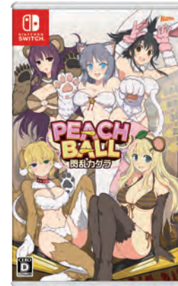
SENRAN KAGURA series PEACH BALL SENRAN KAGURA ©2018 Marvelous Inc./HONEY PARADE GAMES Inc.