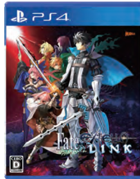
Fate/EXTRA series Fate/EXTELLA LINK ©TYPE-MOON ©2018 Marvelous Inc.