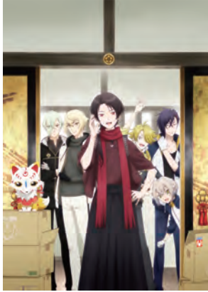
TOUKEN RANBU HANAMARU 2