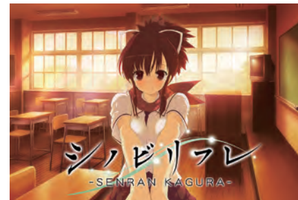
SENRAN KAGURA series Shinobi Reflation - SENRAN KAGURA - ©2017 Marvelous Inc./HONEY PARADE GAMES Inc.