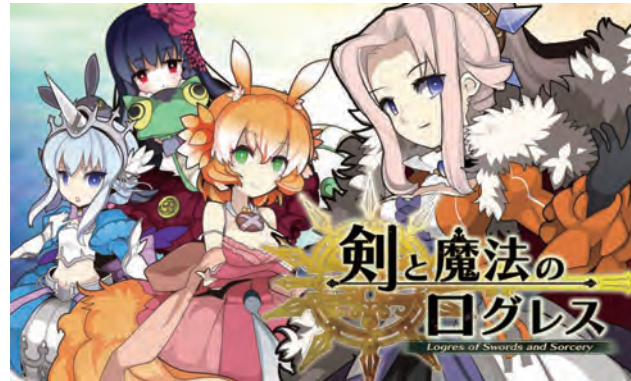
Logres of Swords and Sorcery