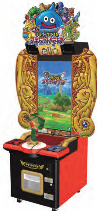
DRAGON QUEST SCANBATTLERS

© 2017-2019 ARMOR PROJECT/BIRD STUDIO/Marvelous/ SQUARE ENIX All Rights Reserved.