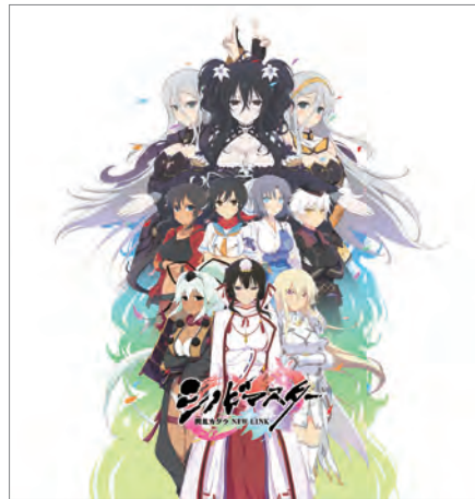
SHINOVI MASTER -SENRAN KAGURA NEW LINK- ©Marvelous Inc. ©HONEY PARADE GAMES Inc.