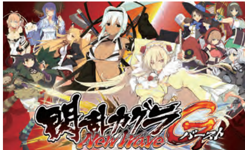
SEN-RAN KAGURA NewWave G-Burst