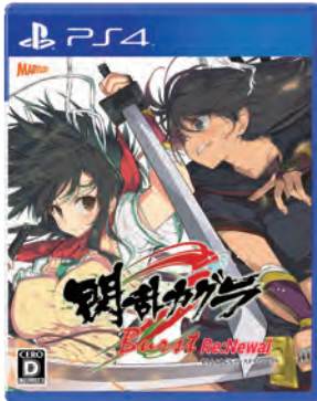
SENRAN KAGURA series SENRAN KAGURA Burst Re:Newal ©2018 Marvelous Inc./HONEY PARADE GAMES Inc.