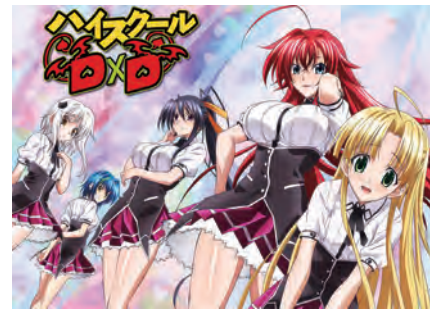
High School D × D

©2014 YUJI SHIOZAKI · SHONENGAHOSHA/ IKKITOUSEN EE PARTNERS ©2014 Marvelous Inc.