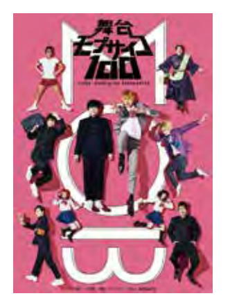
Stage MobPsycho 100 ©ONE, Shogakukan/Stage MobPsycho 100Project 2018