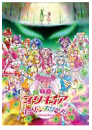
Pretty Cure Super Stars! the Movie

©2018 Pretty Cure Super Stars! the Movie Production Committee