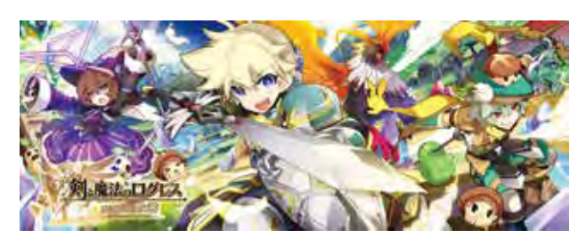
Logres of Swords and Sorcery: Goddess of Ancient ©Marvelous Inc. Aiming Inc.