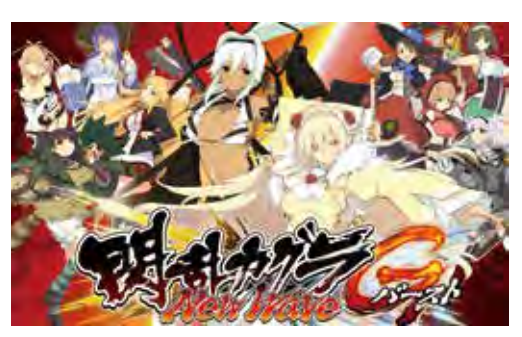
SENRAN KAGURA NewWave G-Burst ©Marvelous Inc.