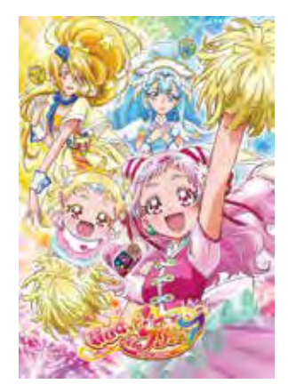
HUG! Pretty Cure ©Toei Animation. All Rights Reserved