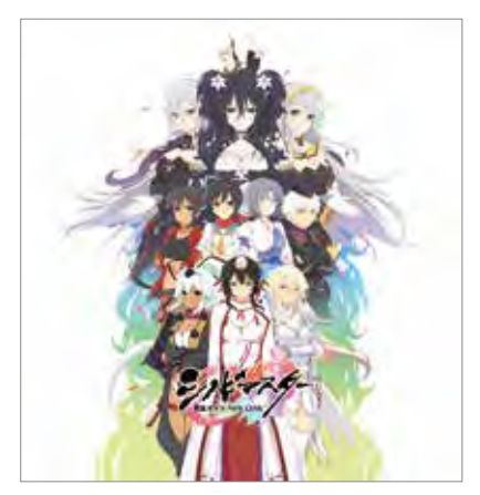
SHINOVI MASTER -SENRAN KAGURA NEW LINK-

©Fujio Akatsuka, OSOMATSU SAN Production Committee ©D-techno / Marvelous Inc.