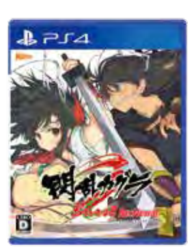
SENRAN KAGURA Burst Re:Newal ©2018 Marvelous Inc./HONEY PARADE GAMES Inc.