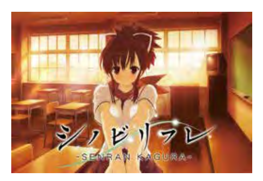
Shinobi Reflation - SENRAN KAGURA -©2017 Marvelous Inc./HONEY PARADE GAMES Inc.