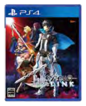
Fate/EXTELLA LINK ©TYPE-MOON ©2018 Marvelous Inc.