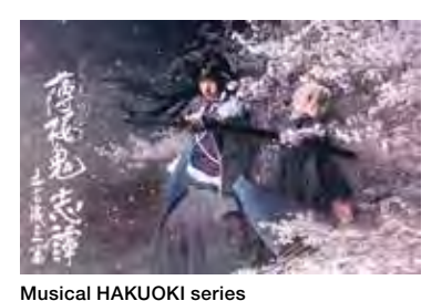
Musical HAKUOKI ©IDEA FACTORY / DESIGN FACTORY / Musical HAKUOKI Project