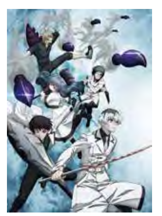
Tokyo Ghoul:re