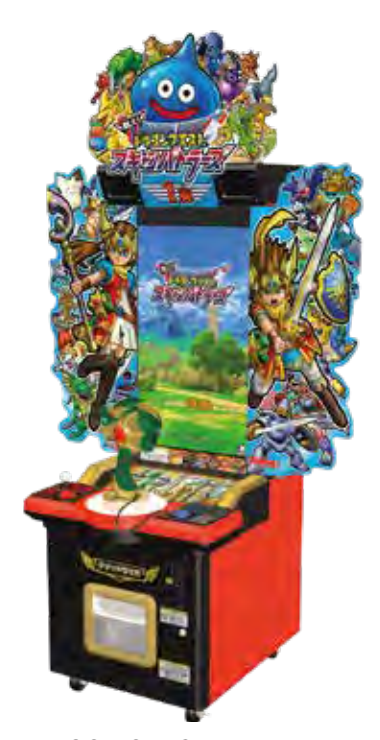
DRAGON QUEST SCANBATTLERS

©2018 Pokémon. ©1995-2018 Nintendo/Creatures Inc. / GAME FREAK inc.Developed by T-ARTS and MARV TM, (R), and character names are trademarks of Nintendo.