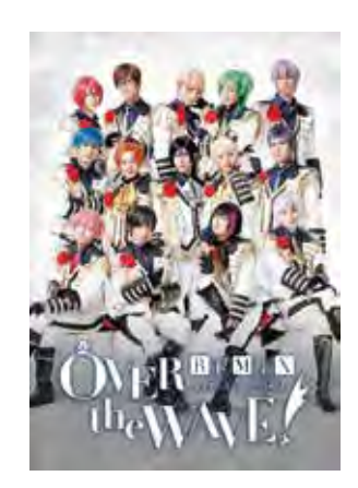
B-PROJECT on STAGE OVER the WAVE! REMIX

©GoRA · GoHands / k-project ©GoRA · GoHands / stage k-project