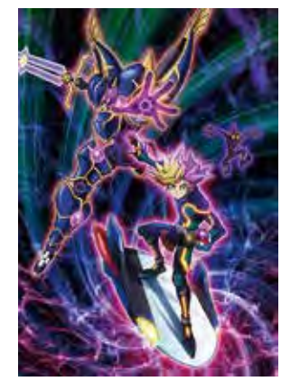
Yu-Gi-Oh! VRAINS ©1996 Kazuki Takahashi ©2017 NAS • TV TOKYO

©2018 Pretty Cure Super Stars! the Movie Production Committee