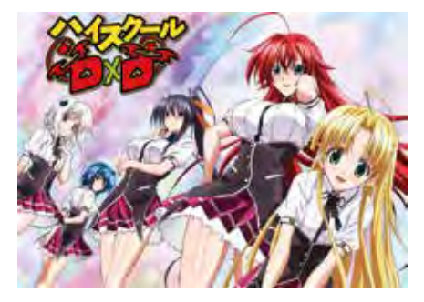
High School D×D