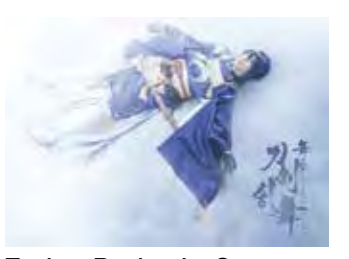
Touken Ranbu the Stage ©Touken Ranbu the Stage Production Committee

©Wataru Watanabe (Akitashoten) 2008/ Yowamushi Pedal 04 Film Partners 2018 ©Wataru Watanabe (Akitashoten)/Marvelous, TOHO, TMS ENTERTAINMENT