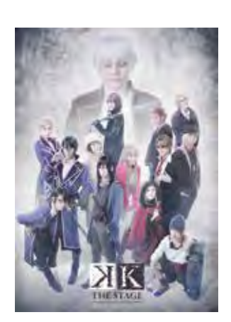
K THE STAGE -MISSING KINGS-

©2016 Happy Elements K.K./Ensemble Stars! STAGE PROJECT