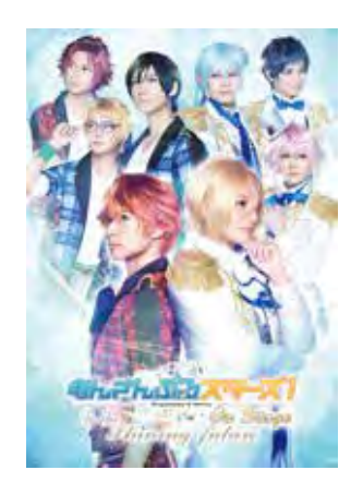
"Ensemble Stars! On Stage" \sim To the shining future \sim

©2016 Happy Elements K.K./Ensemble Stars! STAGE PROJECT