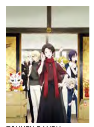
TOUKEN RANBU HANAMARU 2 ©2018 TOUKEN RANBU HANAMARU 2 Project