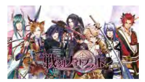
Sengoku Night Blood ©2017 Marvelous Inc. / KADOKAWA / IDEA FACTORY