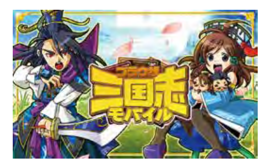
Browser Sangokushi for Mobile ©Marvelous Inc. ©BEFOOL Inc.