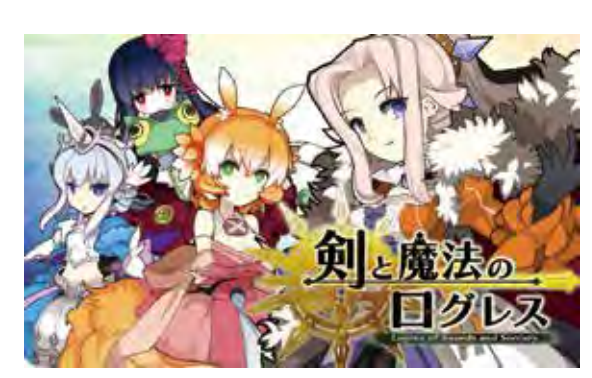
Logres of Swords and Sorcery