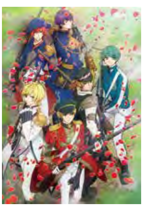
The Thousand Masketeers