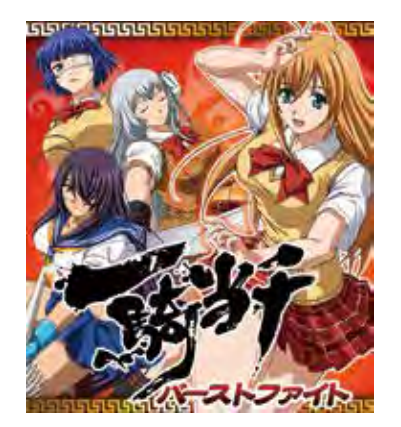
Ikki-Tousen Burst Fight ©2014 YUJI SHIOZAKI · SHONENGAHOSHA/ IKKITOUSEN EE PARTNERS