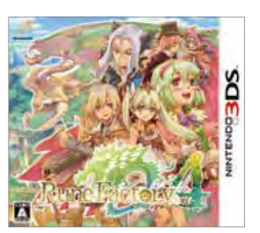
Rune Factory series Rune Factory 4 ©2012 Marvelous Inc.