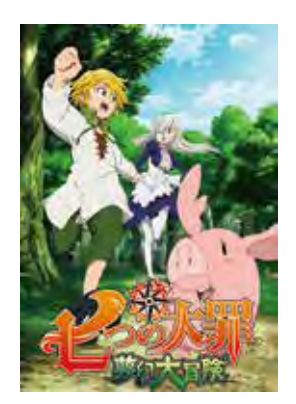
The Seven Deadly Sins Mugendaiboken

©Nakaba Suzuki,Kodansha/The Seven Deadly Sins Revival of the Commandments Project,MBS @Marvelous Inc. Studio Hoippo Inc.