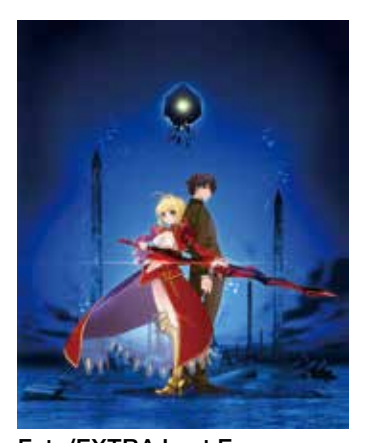
Fate/EXTRA Last Encore ©TYPE-MOON/Marvelous, Aniplex, Notes, SHAFT