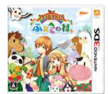
BOKUJO MONOGATARI series BOKUJO MONOGATARI FUTAGO NO MURA + ©2017 Marvelous Inc. All Rights Reserved.