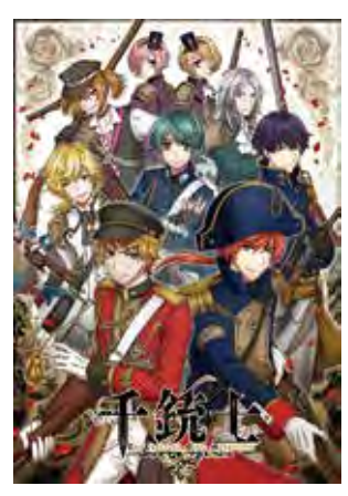
The Thousand Noble Musketeers ©LINE Corporation / Marvelous Inc.