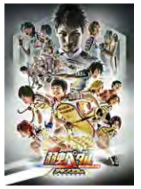
Stage Yowamushi Pedal series Stage [Yowamushi Pedal] the new period: The Kingdom

@2009 TAKESHI KONOMI @2014 NAS, THE PRINCE OF TENNIS II PROJECT ©1999 TAKESHI KONOMI/2015 MUSICAL THE PRINCE OF TENNIS PROJECT